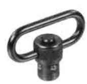
1.25" LOOP TL-QDSW08B