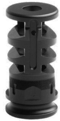
.223/5.56 | 1/2"X28 ■ / TLUMD01