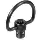
1.29" C-SHAPE LOOP TL-QDSW08C