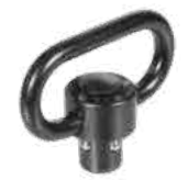
1.38" LOOP TL-QDSW18