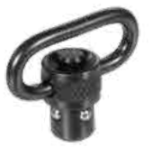
1.09" LOOP TL-QDSW08A

High Strength Steel Construction with a Matte Black Finish