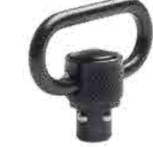
1.41" LOOP TL-QDSW38