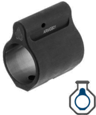
■ / MNT-ARMGB01