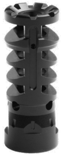
.223/5.56 | 1/2"X28 ■ / TLUMD02