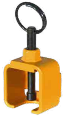
■ / MNT-16AD2-C